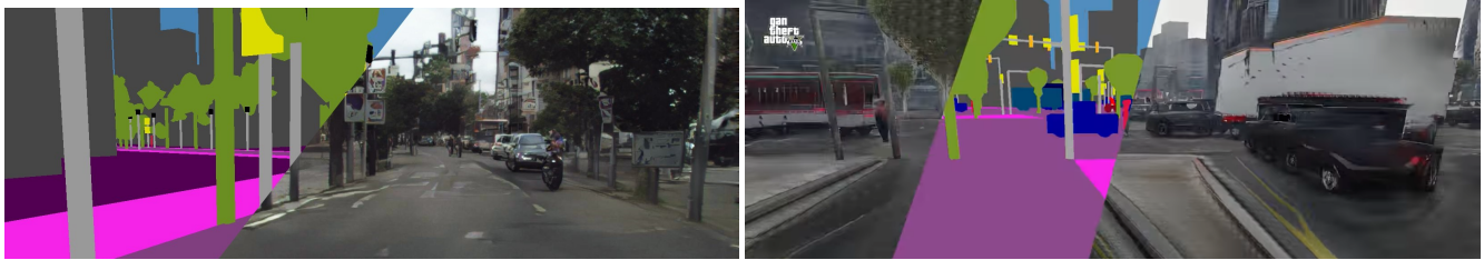
Figure 1: Cross-views of Cityscape [Left] and GTA V [Right] texturings using Pix2PixHD.