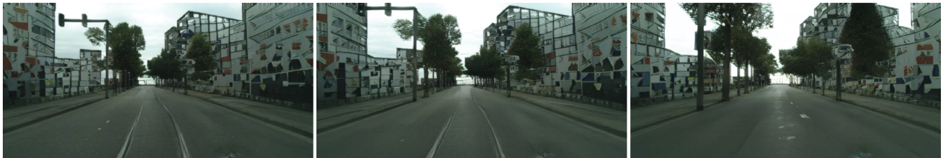
Figure 5: Vid2Vid trained with 128 generator features on Cityscapes dataset. Frames are temporally consistent, minimizing flickering while also learning a more cohesive global illumination of the scene.