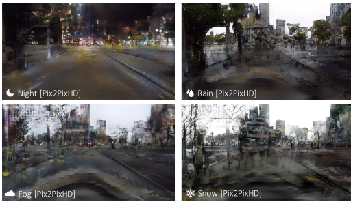
Figure 6: Pix2PixHD trained on the ACDC Weather dataset for 200 epochs. Each dataset contained roughly 500 images.

Given the processing speeds of the style transfer algorithms in Table 1, consumer-grade GPUs could handle real-time support for most of these texturings. When optimizing the generator size for inference speeds, we found a correlation between the dataset size and the generator complexity needed to accurately retain styling capabilities. Smaller datasets such as ACDC did not require as complex a model for inference and could run at a higher FPS than Cityscape. GTA being the largest of the datasets required the highest model complexity to retain its higher-quality results, leading it to run the slowest. The Vid2Vid Cityscape model performed at a substantially lower framerate compared to the other models primarily because it computed the optical flow between images, adding substantially to the feature complexity and creating frame dependencies in the inferencing scheme. For more demanding inference models such as Vid2Vid, developers could instead attempt to host the game and style transfer over the server with higher-throughput devices and stream frames back to the user’s device for faster frame rates, especially as cloud gaming such as Google Stadia [7] become more popular.