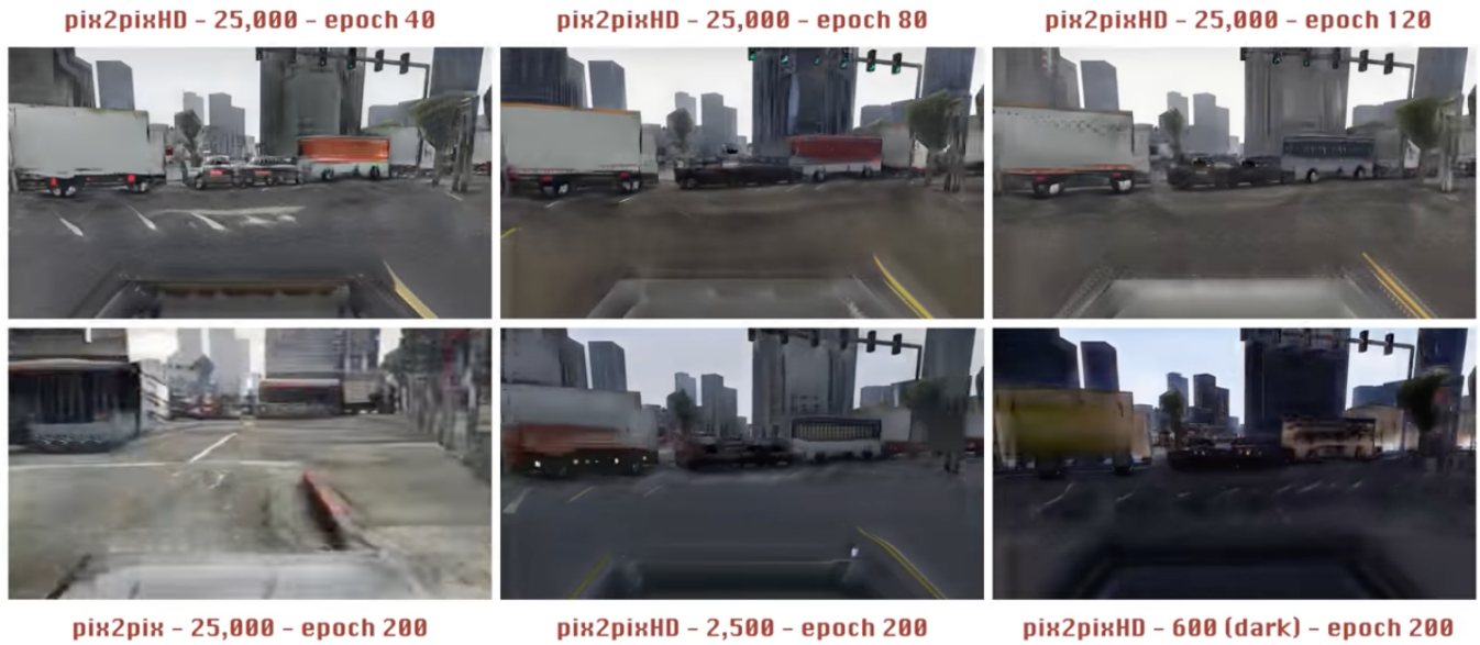
Figure 4: Comparing Pix2Pix against Pix2PixHD. Models were trained with 64 generator features on the full 25,000 images, while a smaller Pix2PixHD model was trained on 2,500 images for more epochs. The Pix2Pix model suffered from rapid color flickering while the Pix2PixHD model was able to learn a more consistent lighting representation.